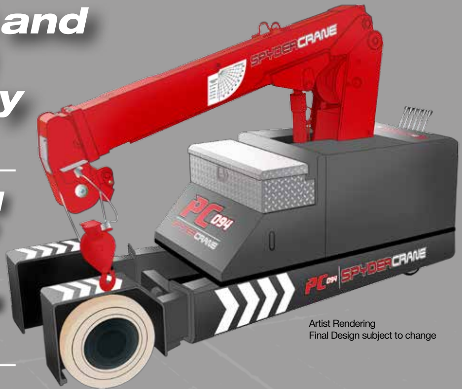
Artist Rendering Final Design subject to change